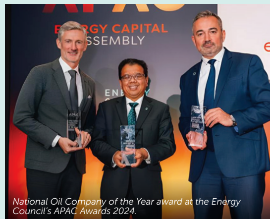
National Oil Company of the Year award at the Energy Council's APAC Awards 2024.

PETRONAS was named National Oil Company of the Year for the second consecutive year, a recognition of excellence in the Asia Pacific energy sector. Evaluated by 28 industry experts, the award highlights our innovation, leadership in energy transition and commitment to achieving net zero carbon emissions by 2050.