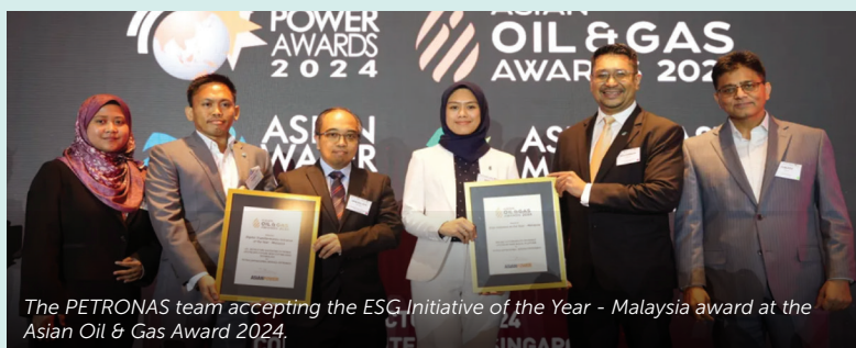
The PETRONAS team accepting the ESG Initiative of the Year - Malaysia award at the Asian Oil & Gas Award 2024.

PETRONAS secured two industry wins for innovation and sustainability efforts. The award-winning UP+ platform centralises critical operational data to improve decision-making and efficiency, while the Upstream GHG Digital Platform consolidates and streamlines GHG data across Malaysia operations to support emissions management and reporting.